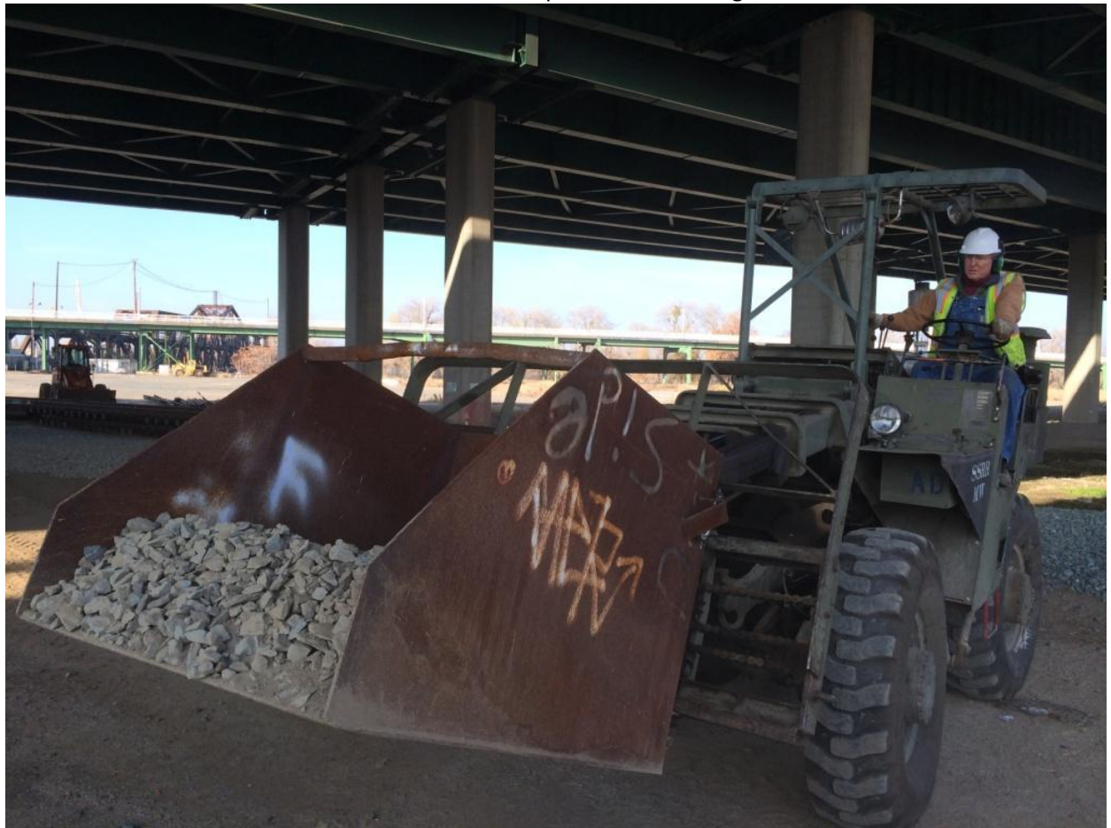
Steve N., EIC of Big Green, scooping up rock with the scoop bucket