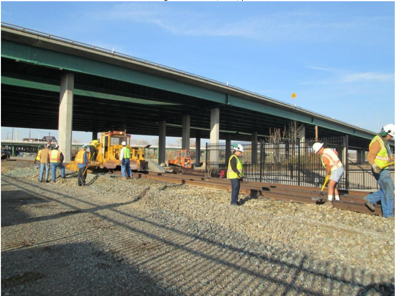
Shifting rock by hand is a team effort – especially while trying to make emergency repairs to the regulator...