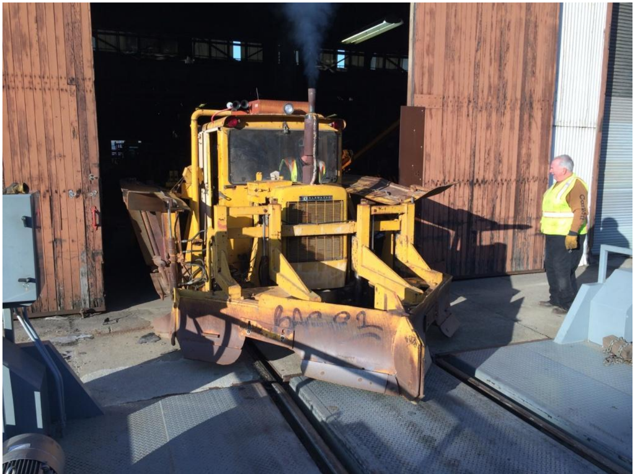
The beast emerges...