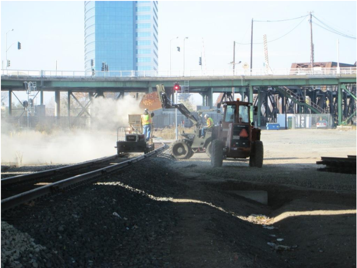
Choreography with big machines