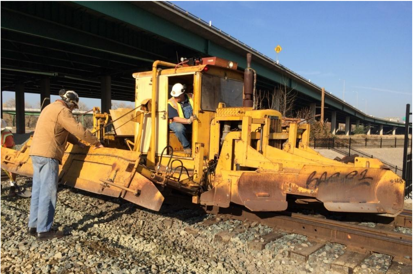
It won't go down! Push, Alan, push!